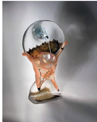
Light worker 2021