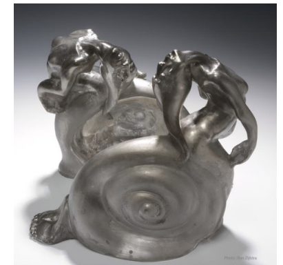
Face with future