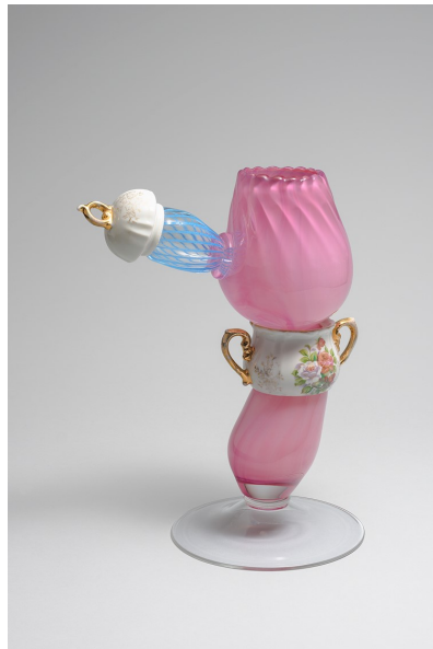
Glass in tea cups 2020