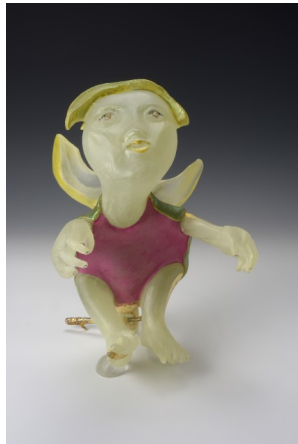
Selfie as Kappa 2021