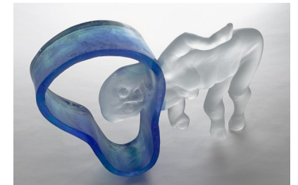
What is she thinking? 2019