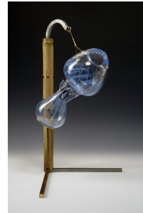
No title 2020