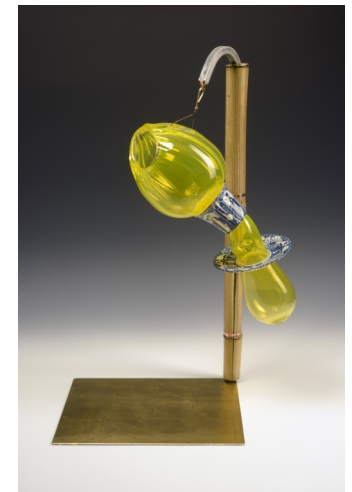
No title 2020