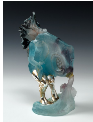
Echoing dream 2017