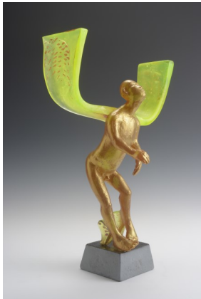
Falling angel 2021