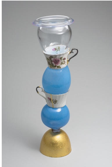
Glass in tea cups 1 2020